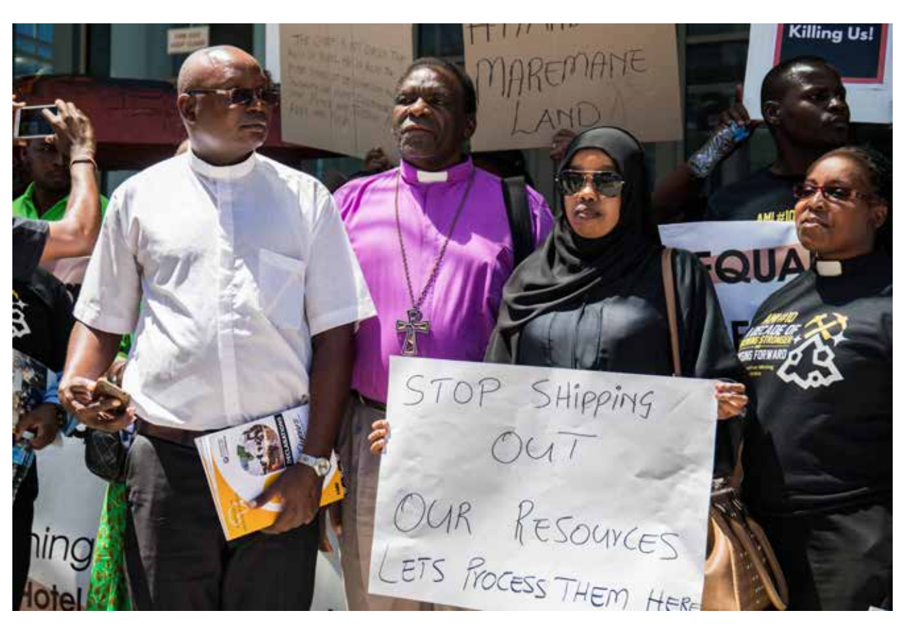
Faith leaders unite to address global inequality at the Alternative Mining Indaba.

The life of Christ was one of poverty, an impression very generally derived from the familiar words of Isaiah 53 and also from Phil. 2:7 (took Himself the form of a slave) and 2 Cor. 8:9 (He became poor that yet through his poverty might become rich). Jesus was a poor man who spent his ministry helping the poor. His public ministry was holistic. Healing and preaching were inseparable and He spent more time on healing than preaching. His ministry was to the whole person. He knew that people with hungry stomachs and diseased bodies need physical liberation in order to hear the word of God – of his saving grace. He stooped low to raise everybody; the lepers, the cripples, the demoniacs, the blind, the deaf, the prostitutes, tax collectors, women and children.