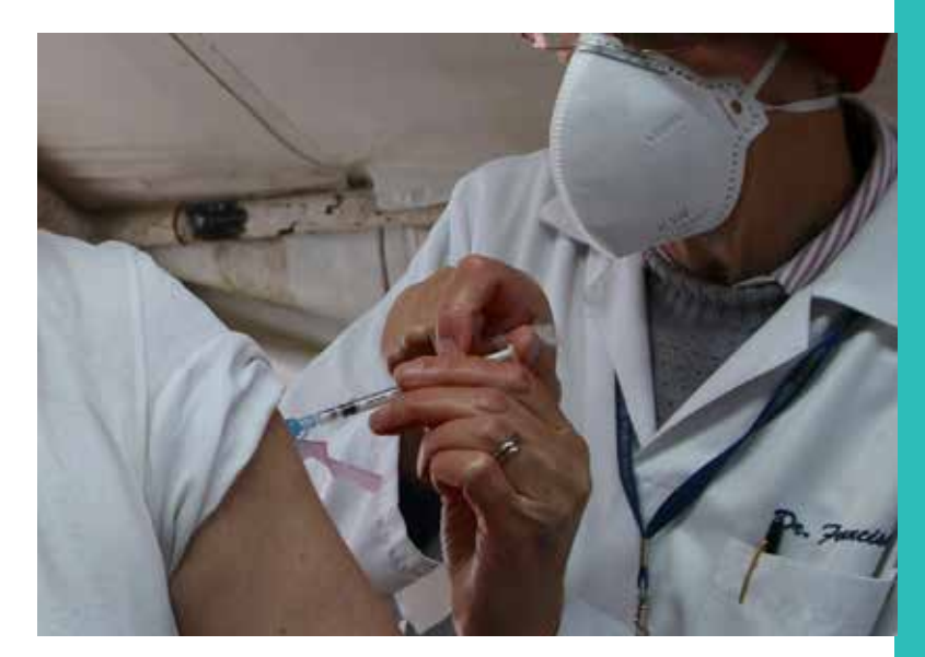
There is unequal access to vaccines.