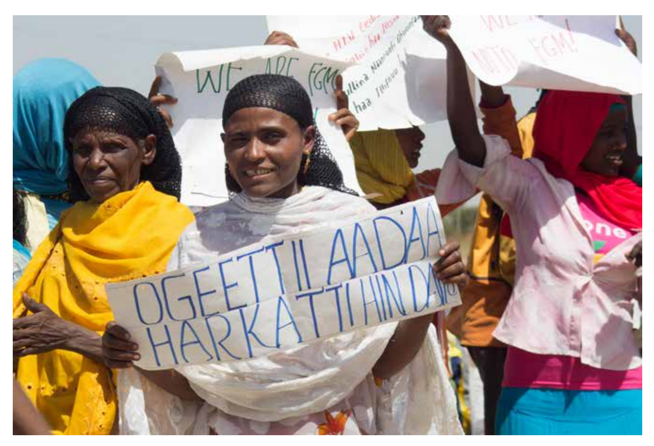
Women protesting against female genital mutilation in Siraro in Arsi, Ethiopia, Photo: Hilina Abebe/NCA.

Fundamentalist interpretations of religion are giving expression to violent and extremist practices using religion and faith to exclude those who do not conform with a social, economic, political and cultural order. This is limiting women's rights, their access to properties and resources, and the autonomy to decide on their sexual and reproductive life. Religion can also be a barrier to women's access to education and involvement in politics. These limitations are putting women in a vulnerable situation, bringing physical insecurity, and increasing violence and other forms of human rights