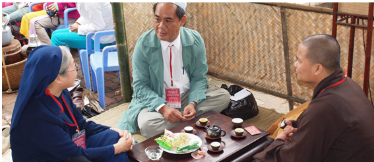
Interfaith discussion on supporting HIV/AIDS between Catholics, Buddhists and Muslims; Second Interfaith Conference, Hue, 2009