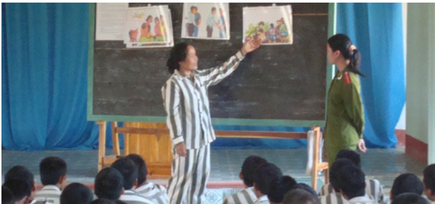
Practice session of peer educators on HIV /AIDS for prisoners, 2010