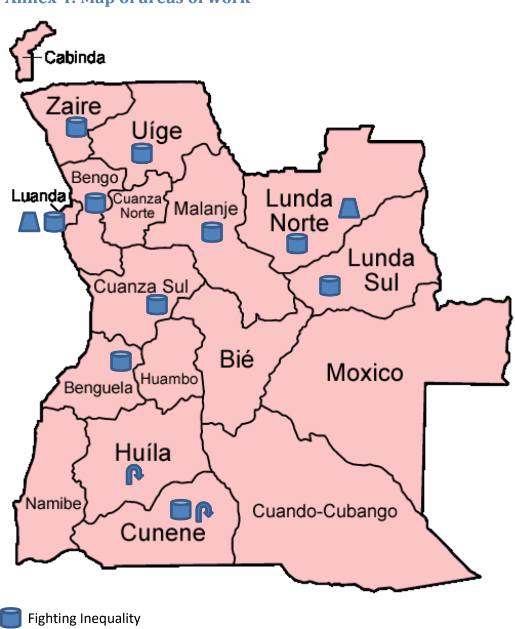
Annex 4: Map of areas of work

Annex 3: Risk Management Matrix (separate document)