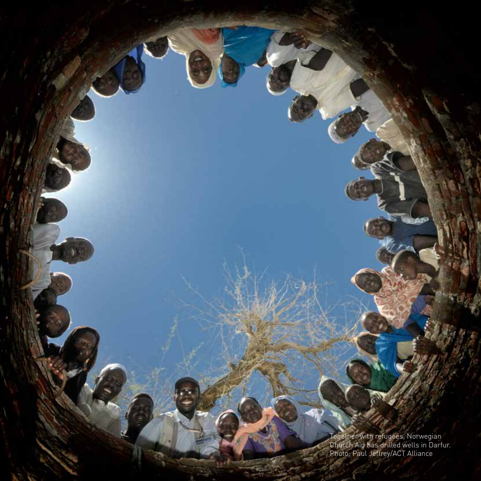
Together with refugees, Norwegian Church Aid has drilled wells in Darfur.