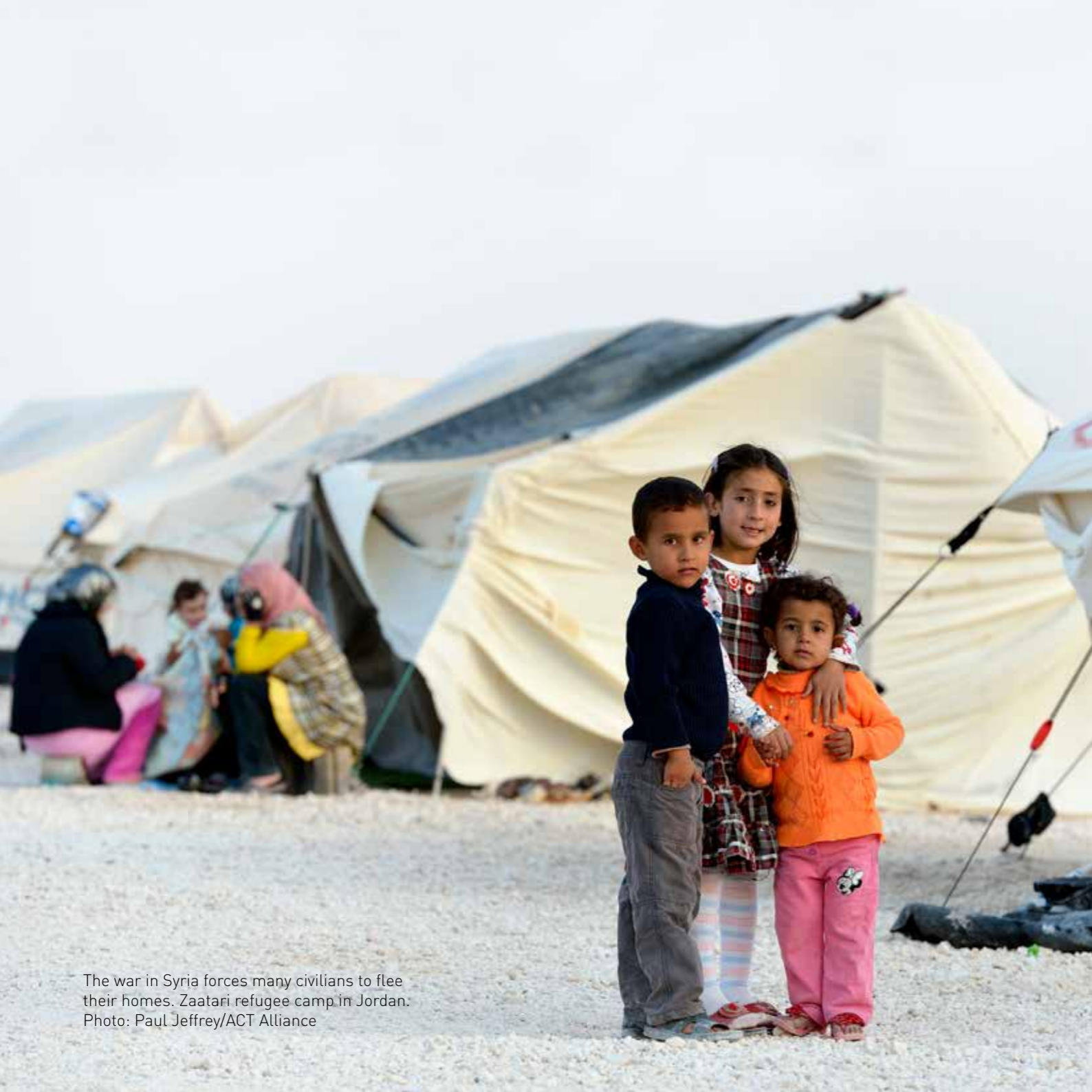
The war in Syria forces many civilians to flee their homes. Zaatari refugee camp in Jordan.