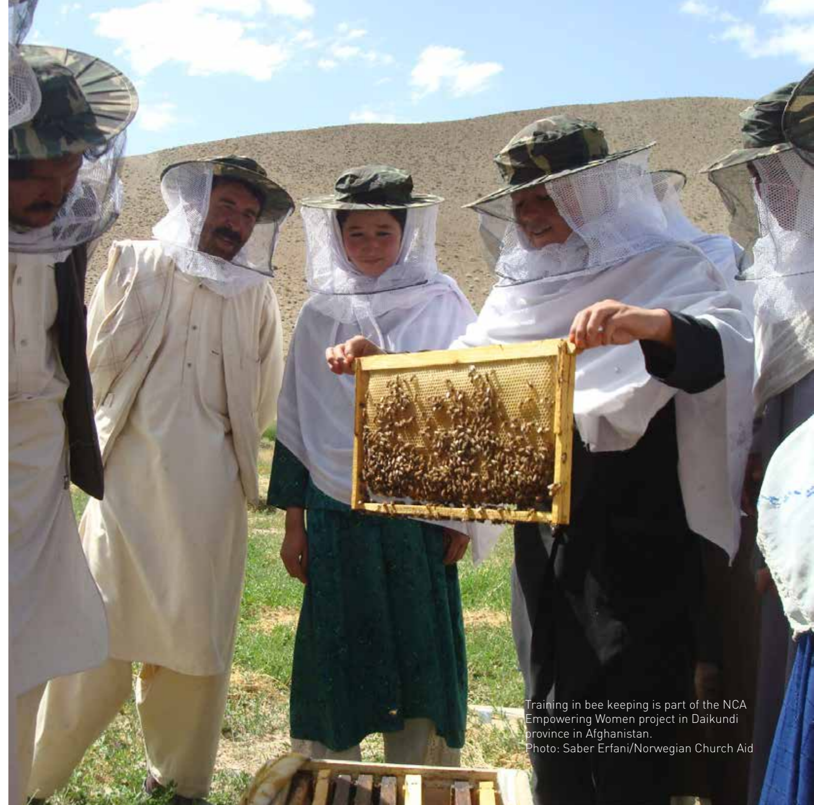
Training in bee keeping is part of the NCA Empowering Women project in Daikundi province in Afghanistan.

When local or national authorities gain enough momentum to take ownership of results related to the policies and programmes to which we have contributed, we see this as an indicator of success. At that point, Norwegian Church Aid will gradually and systematically transfer all responsibility to civil society partners and national governments. We will strive for governments to become increasingly accountable to their citizens and for our partners to be strong and independent civil society actors that are able to sustain activities and social mobilisation. To achieve this national resource mobilisation will be key.