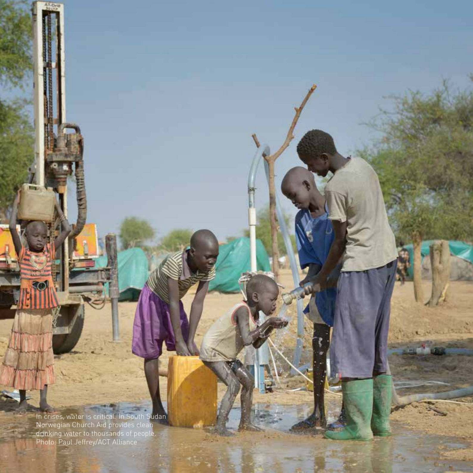
In crises, water is critical. In South Sudan Norwegian Church Aid provides clean drinking water to thousands of people.