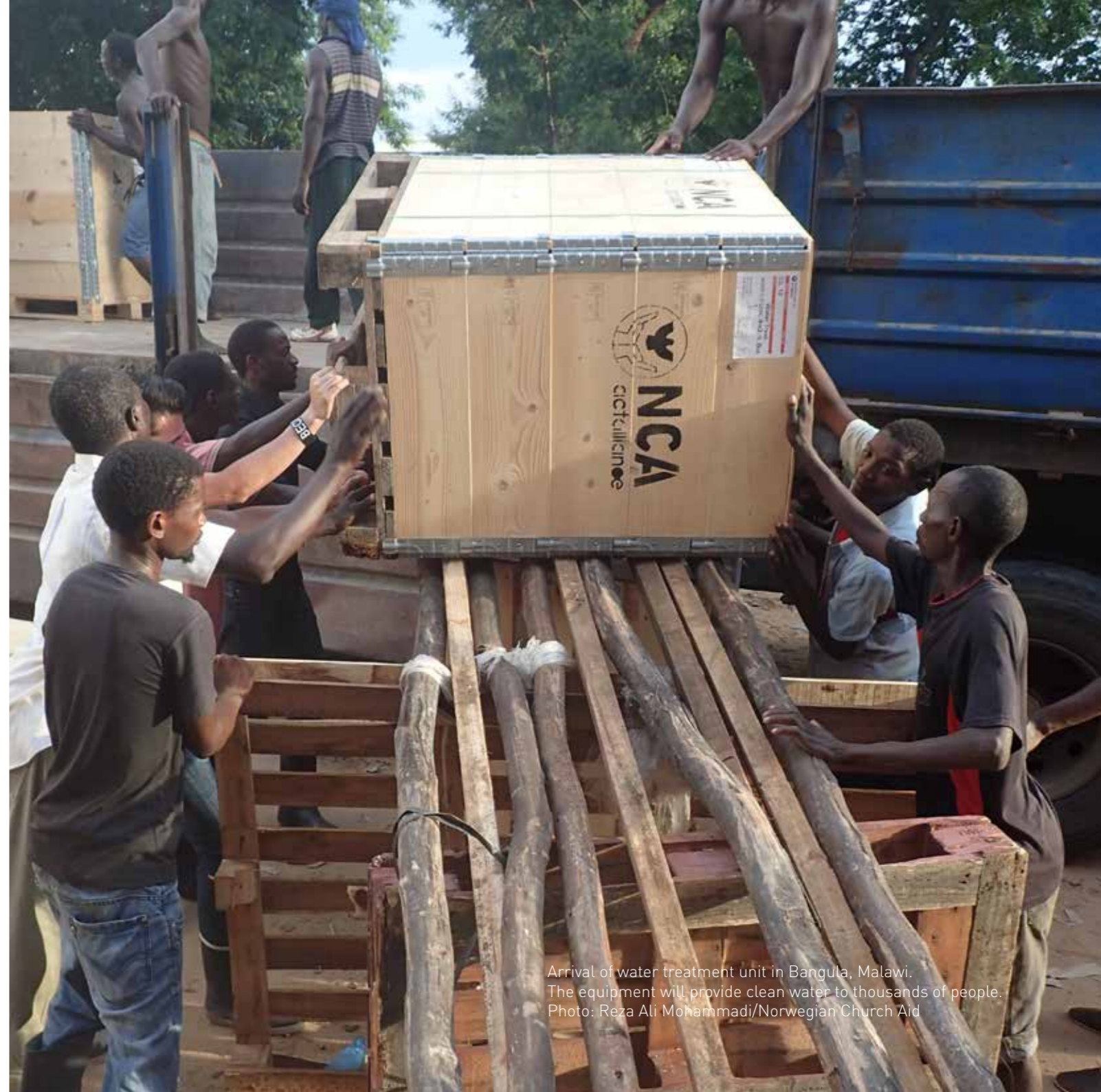
Arrival of water treatment unit in Bangula, Malawi. The equipment will provide clean water to thousands of people.

There is a need for better coordination and cooperation between different actors in order to make progress to end poverty and respond to growing humanitarian crisis. Norwegian Church Aid has developed relationships with specialised professional organisations and institutions in relevant fields who can act as resource organisations for faith-based partners. This way they can contribute with a wide range of knowledge, competencies and skills that might not be readily available within faith-based institutions. Resource organisations complement faith-based actors' ability to reach and mobilise all segments of society and strengthen their competence and networks. Specifically, there is a need to encourage further collaboration between faith actors and women's rights organisations in pursuit of gender justice.